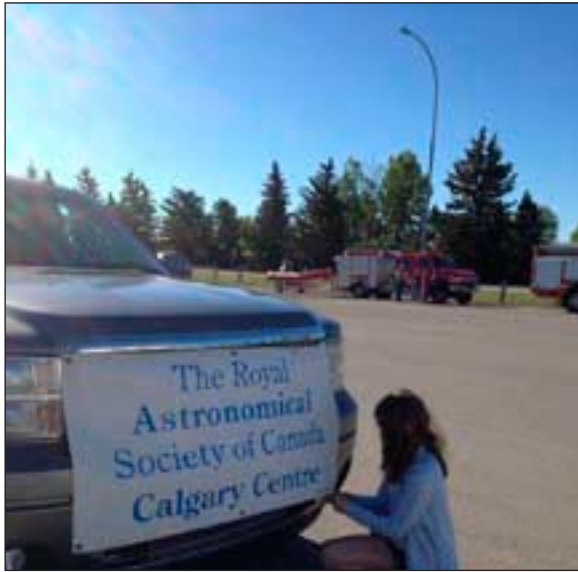
12 year old Emily Morse helps prepare the double vehicle long float by putting the finishing touches on the RASC-Calgary banner.

Spock Days is like the Calgary Stampede for the 1,800 populous Town of Vulcan which almost doubles during its annual celebration. In 2009, the RASC looked at the idea of offering public monthly stargazing meetings at the Trek Center located at the entrance of the town, so they got a head start by putting a float in the annual parade that summer.